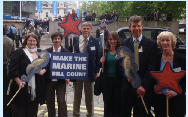
Lincolnshire Wildlife Trust representatives at the Marine and Coastal Access Bill Lobby in May 2009